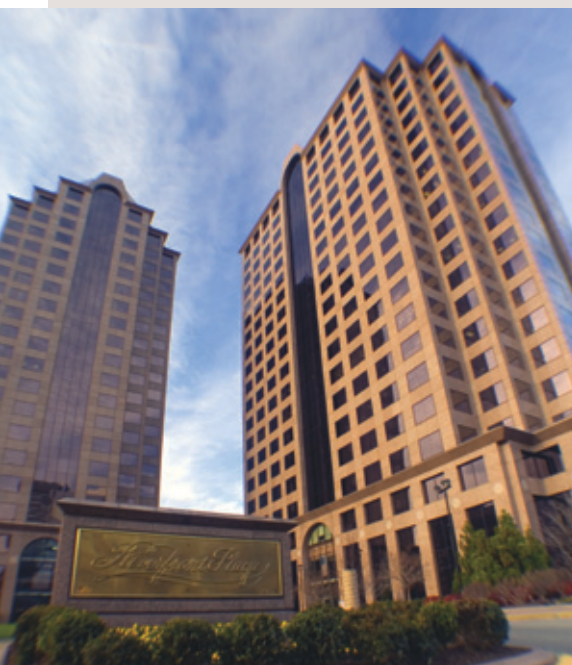
RIVERFRONT PLAZA - RICHMOND, VA