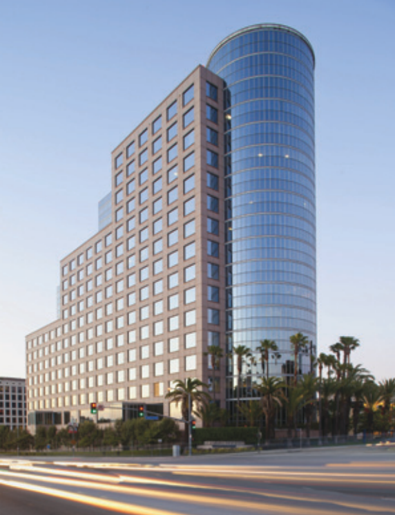
HOWARD HUGHES CENTER - LOS ANGELES, CA